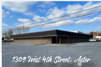
1309 West 4th Street: After