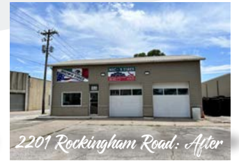
2201 Rockingham Road: After