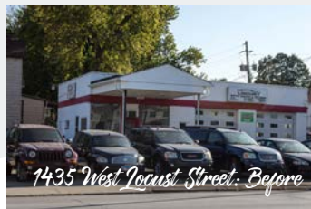
1435 West Locust Street: Before