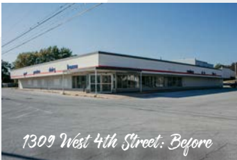
1309 West 4th Street: Before