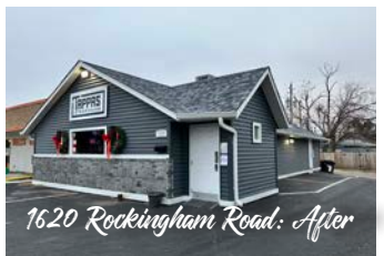
1620 Rockingham Road: After