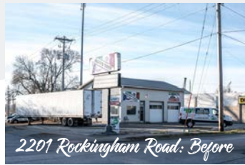
2201 Rockingham Road: Before