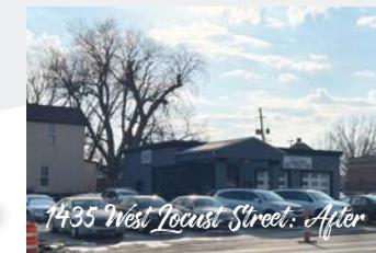
1435 West Locust Street: After