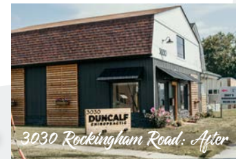
3030 Rockingham Road: After