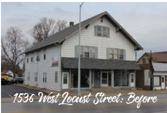
1536 West Locust Street: Before