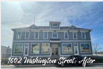
1602 Washington Street: After