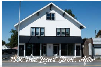
1536 West Locust Street: After