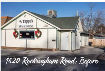
1620 Rockingham Road: Before