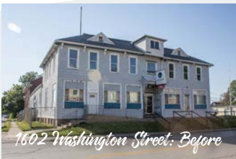
1602 Washington Street: Before